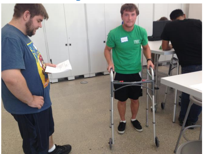
Students participating in Accessibility Simulation Exercises