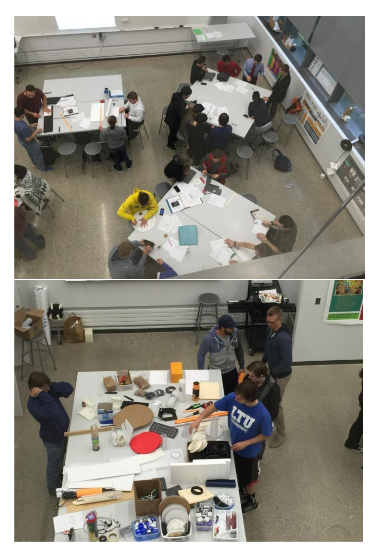
Student teams build mock-up prototypes of their design concepts.