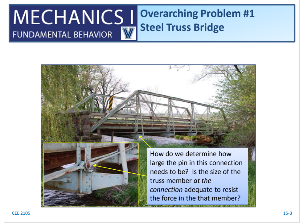
Figure 1. Example of slide used at the beginning of a lecture (Overarching Problem I-1)

After all primary concepts that make up an overarching problem are presented in a regular lecture format, a Thursday flex period class meeting is then used for the overarching problem solution. Students are first given a brief PowerPoint overview of the problem with pertinent background information. Recall that students have already been introduced to the problem at the beginning of several previous lectures, so these overviews are kept quite brief. Students then begin solving the overarching problem either individually or in pairs, in a recitation-type format.